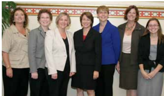
Sen. Amy Klobuchar (D-Minn.), sponsor of drug shortages legislation, S. 296, with the Minnesota delegation after her keynote address at ASHP's Legislative Day breakfast in September.