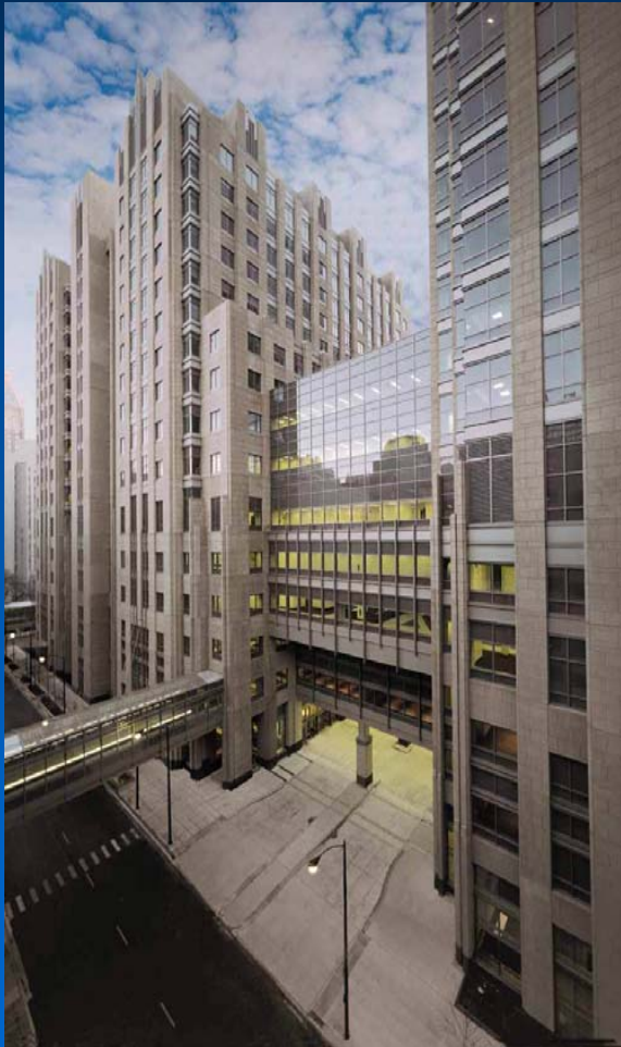
Feinberg and Galter pavilions