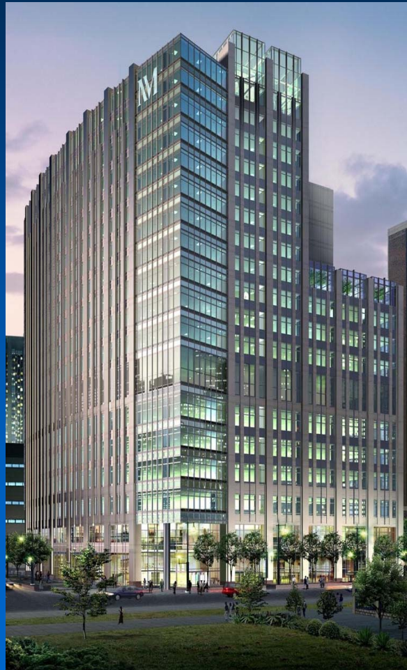
New Prentice Women's Hospital