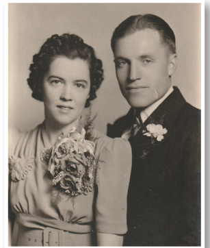
Grandma and Grandpa on their wedding day