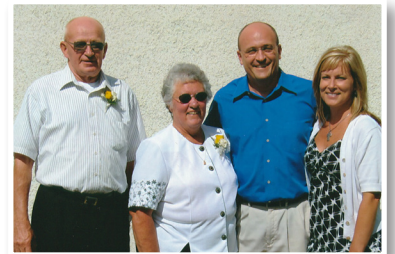
Tom's parents on their 50 th Anniversary