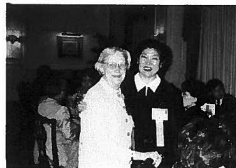
GNF Collection 45 BK5-PT45.jpg