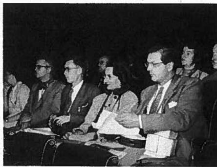
GNF Collection 26 BK5-PT26.jpg