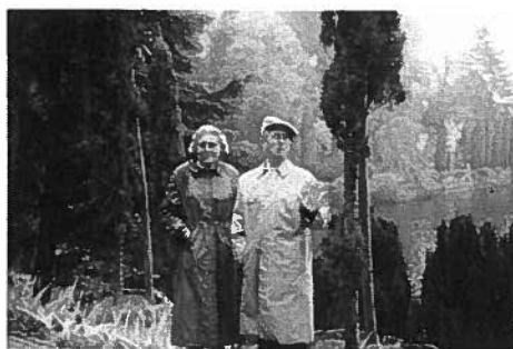
GNF Collection -44 BK5-PT44.jpg