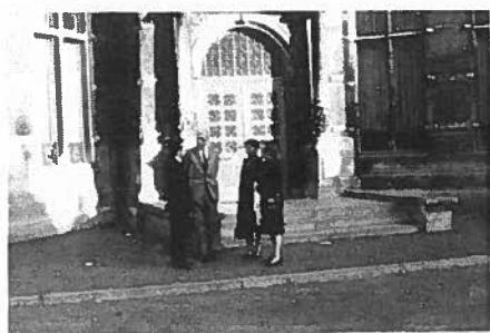
GNF Collection 37 BK5-PT37.jpg