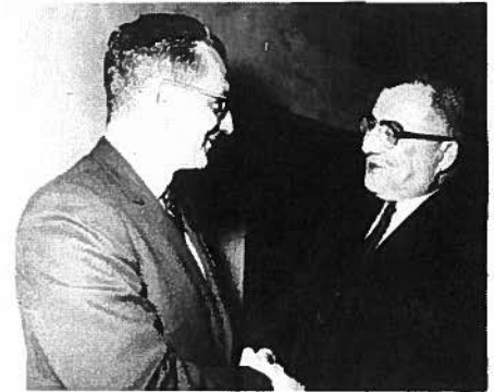
GNF Collection 24 BK5-PT24.jpg