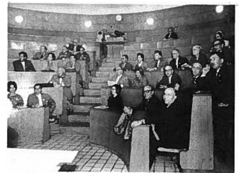
GNF Collection 27 BK5-PT27.jpg