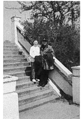
GNF Collection 6 BK5-PT6.jpg