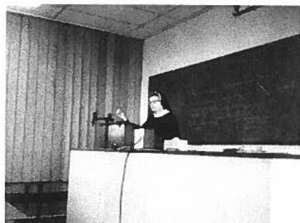
GNF Collection 40 BK5-PT40.jpg