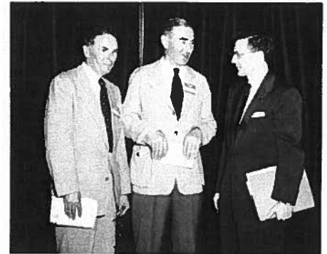
GNF Collection 21 BK5-PT21.jpg