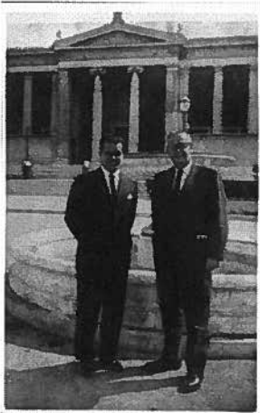
GNF Collection 31 BK5-PT31.jpg