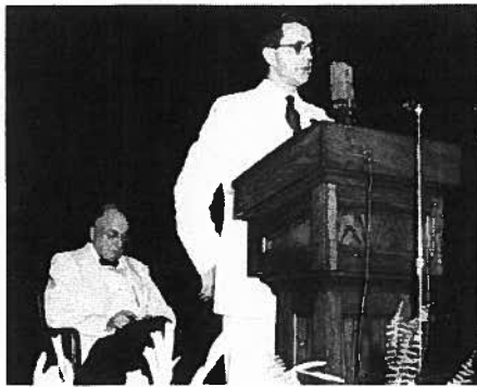
GNF Collection 25 BK5-PT25.jpg