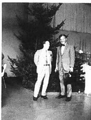
GNF Collection 41 BK5-PT41.jpg