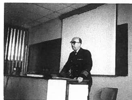
GNF Collection 39 BK5-PT39.jpg