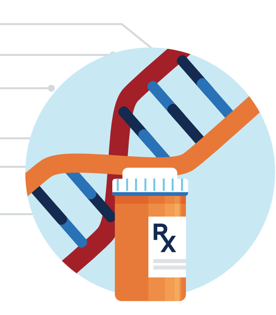
Pharmacogenomics and Precision Medicine