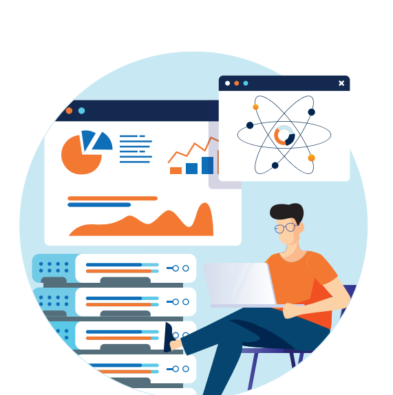
Data Science in Pharmacy Practice and the Medication-Use Process