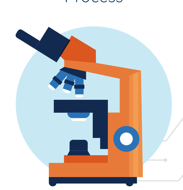
Research in Partnership with ASHP Foundation

Learn more about the ASHP Innovation Center at ASHP.ORG/INNOVATION