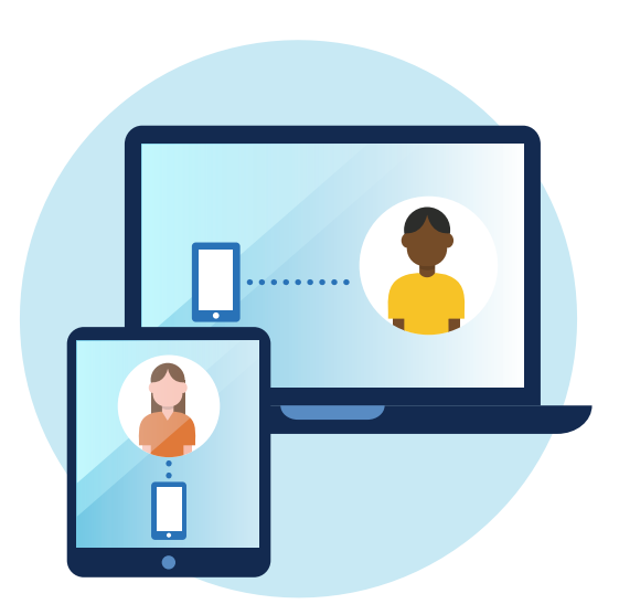
Telehealth Pharmacy Practice and Interprofessional Patient Care