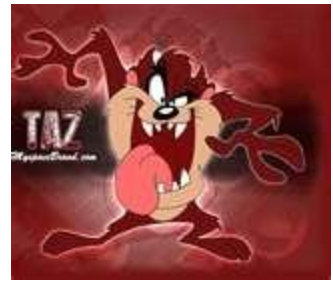
The Good, The Bad and The Ugly