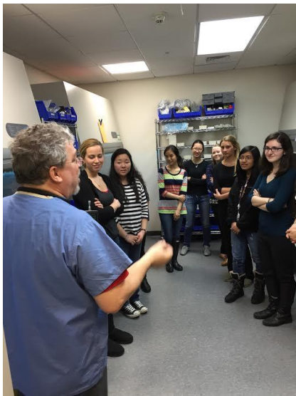
Students attending the sterile compounding workshop in the lab.