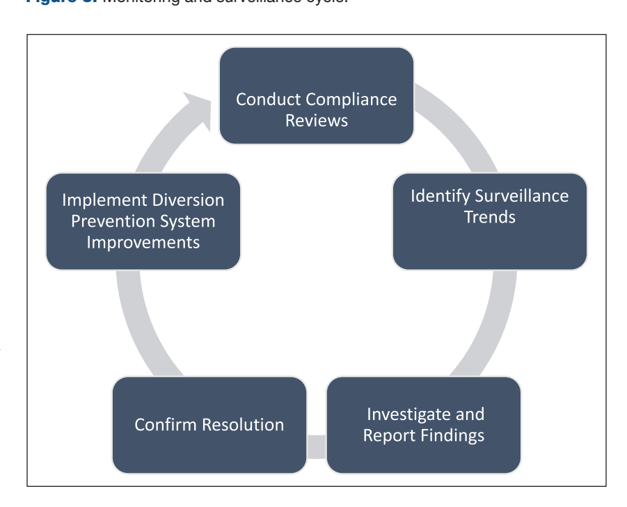
Figure 3. Monitoring and surveillance cycle.

the designated diversion officer, designated pharmacist representative, and pharmacy compliance team (if applicable), should oversee the organization's monitoring and surveillance efforts, including identifying required and routine compliance reviews, determining surveillance metrics for trend reports, assigning responsibility for and frequency of review, providing facility oversight, and conducting established audits of facility-based diversion monitoring and documentation of suspected diversion events. The organization, through the CSDPP committee, should establish and review, at least annually, surveillance requirements, including the definition of monitoring and surveillance measures, thresholds of variance that require action, reporting frequency, and surveillance procedures. The organization, through the CSDPP committee, should ensure that all elements are implemented, conducted in a timely manner, investigated, and reported as required. Core program elements and controls (Figure 2) should be regularly audited for compliance on a scheduled basis (eg, at least annually). The CSDPP committee should provide facility oversight